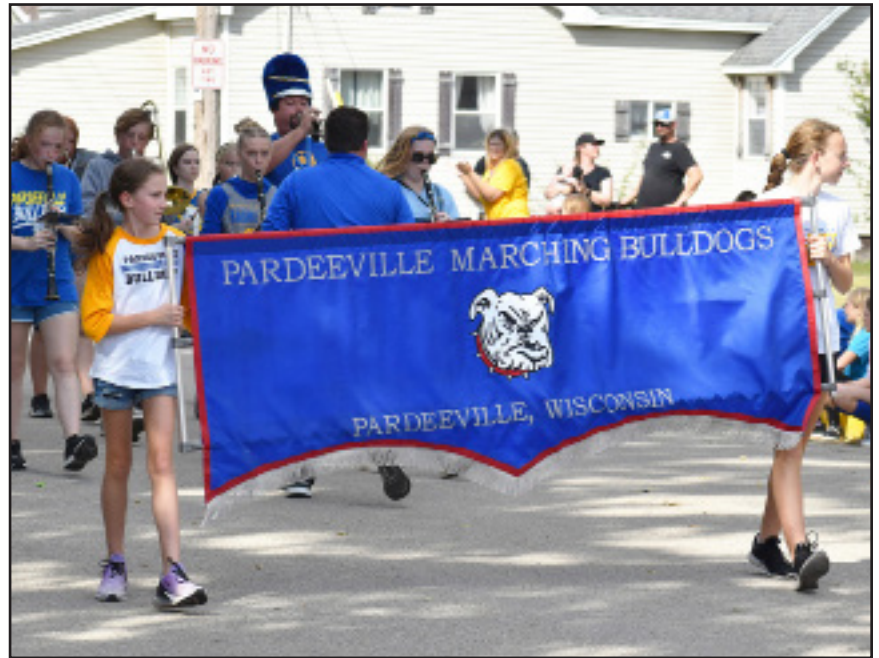
The Pardeeville High School Band plays in the 2024 Pardeeville Homecoming Parade. This year's Homecoming parade will take place on Friday, Oct. 3.

Stay tuned for more details as the event draws closer—but for now, be sure to save the dates and get ready to show your Bulldog pride!