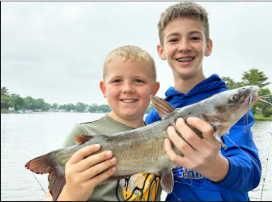
ABOVE: There were a lot of fish caught and a lot of fun had during the Fishing Class in the Pardeeville Summer School Program.

The 2025 Summer School Program once again proved to be a memorable and enriching experience for students, offering them opportunities to learn, grow, and have fun in a supportive environment.