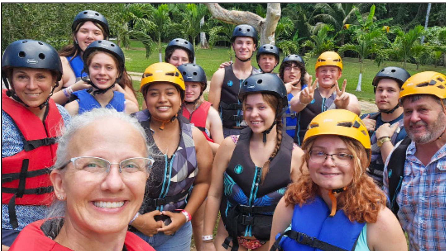
Pardeeville Spanish Club members pose for a photo while getting ready to canoe through the cave at Barton Creek in Belize.