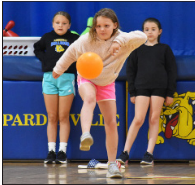
BELOW: The students in the Science Class, get ready to launch their paper airplanes during one day of Summer School.