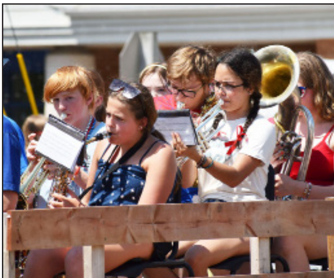
Members of the Pardeeville High School Band perform during the Pardeeville 4th of July Parade.