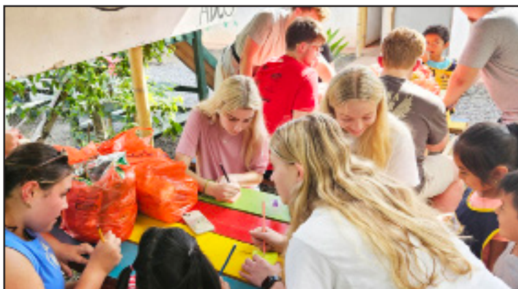
Pardeeville High School Spanish Club members interact and share gifts with young students at a school in Antigua.

For the more adventurous travelers, there was the opportunity to climb a volcano—with some choosing to ride