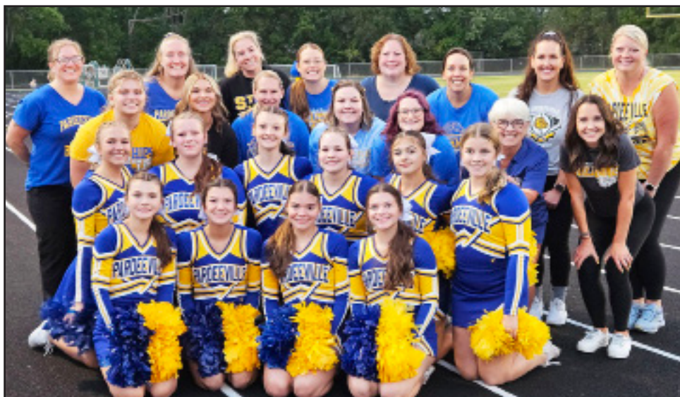
Pardeeville's alumni cheerleaders joined the Pardeeville High School Cheer Squad for a photo during last year's Alumni Cheer Night at Pardeeville High School.