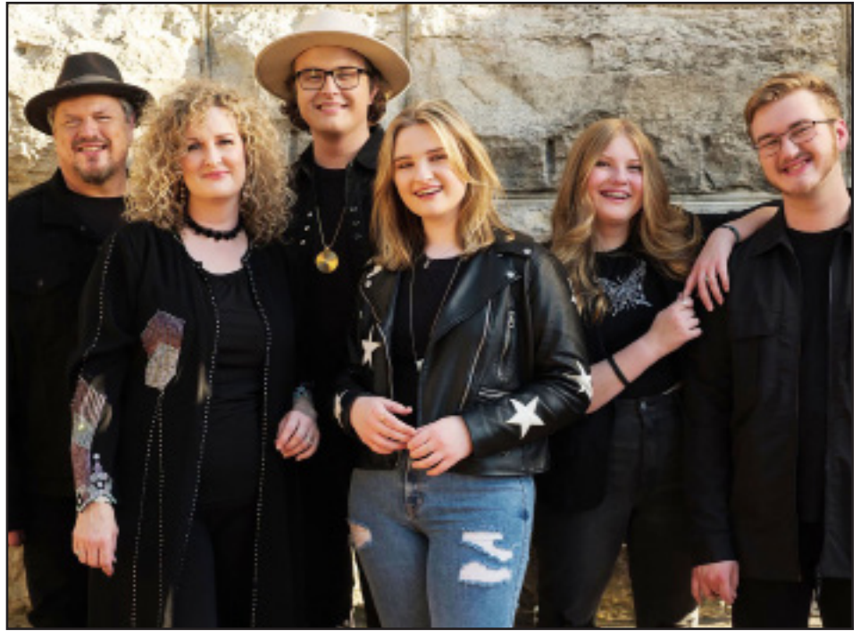
Rockland Road will open the 2025–2026 Performing Arts Series on Friday, Aug. 15 at the Lenz Auditorium. The show will start at 6:30 p.m.

Kick off the season with a powerhouse of harmony! Rockland Road brings generations of musical talent together in one high-energy, vocal-driven band. From classic country roots to pop-rock flair, their electrifying live performance is one you won't want to miss. Rolling Stone hails them as “exuberant!”